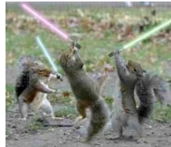
Even the squirrels got into it!